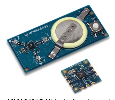
MMA8491Q Xtrinsic Accelerometer 3-Axis Tilt Threshold Sensor Demo

Expanding on more than 30 years of sensor innovation, our Xtrinsic sensing solutions are designed with the right combination of high-performance sensing capability, processing capacity and customizable software to help deliver smart, differentiated sensing applications. With Xtrinsic sensing solutions, our vision is to offer a diverse and differentiated product portfolio to meet the expanding needs of the automotive, consumer and industrial segments. Xtrinsic solutions offer ideal blends of functionality and intelligence designed to help our customers differentiate and win in highly competitive markets.